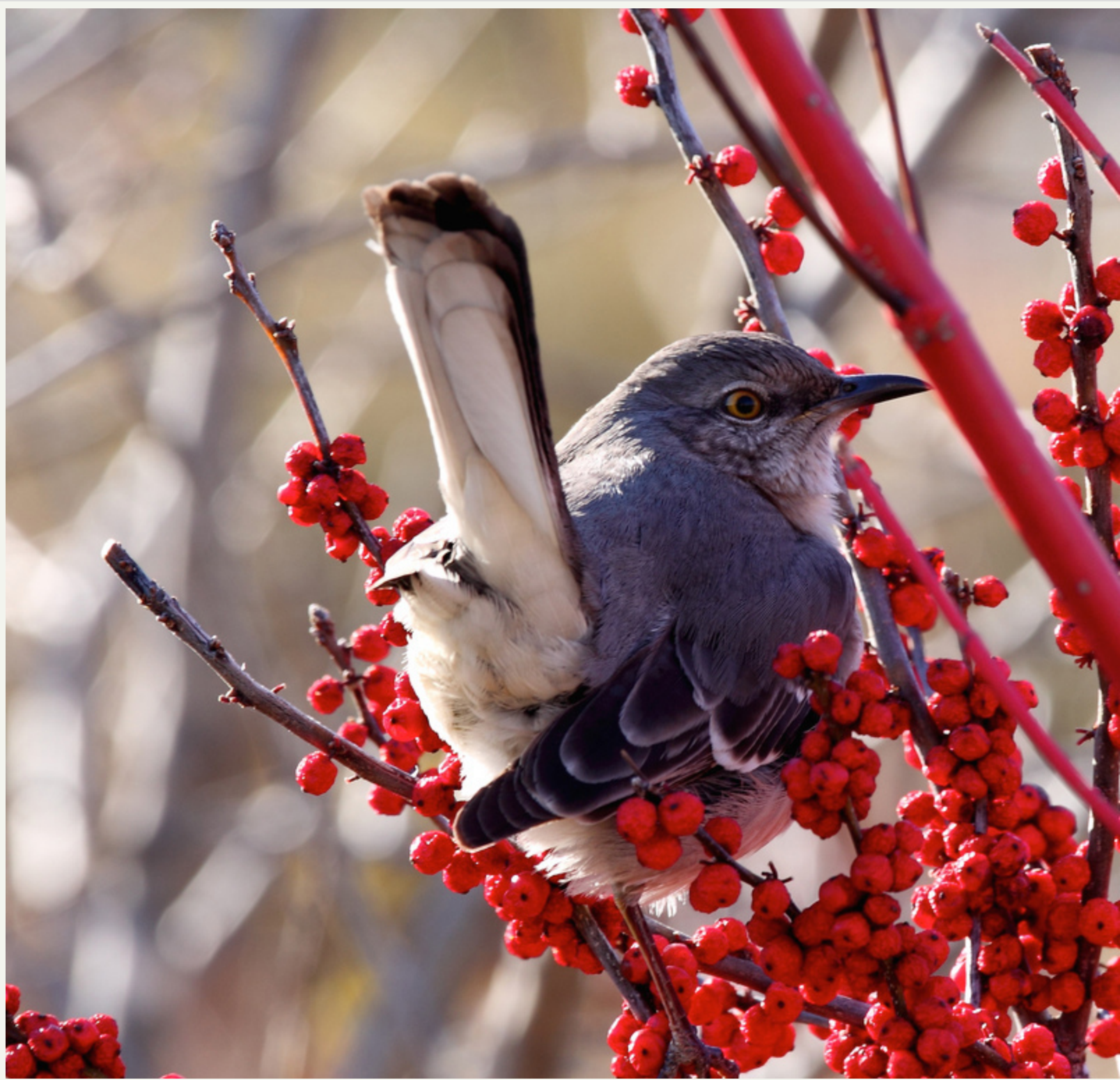
Northern mockingbird (Mimus polyglottos) eating winterberry (Ilex verticillata) in the National Garden